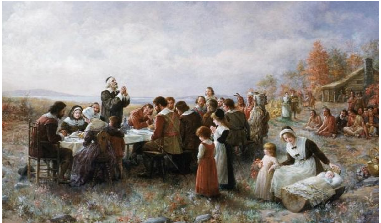
“First Thanksgiving at Plymouth” oil painting by Jennie A. Brownscombe

This painting more closely resembles what most historians believe the actual setting was like. There were two witnesses, Bradford and Winslow, who wrote about that first fall harvest but their descriptions were slight. Edward Winslow’s account merely states: