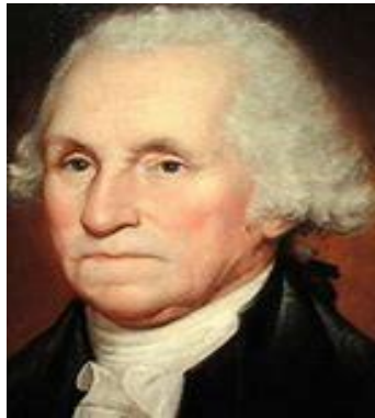
First President & Founding Father