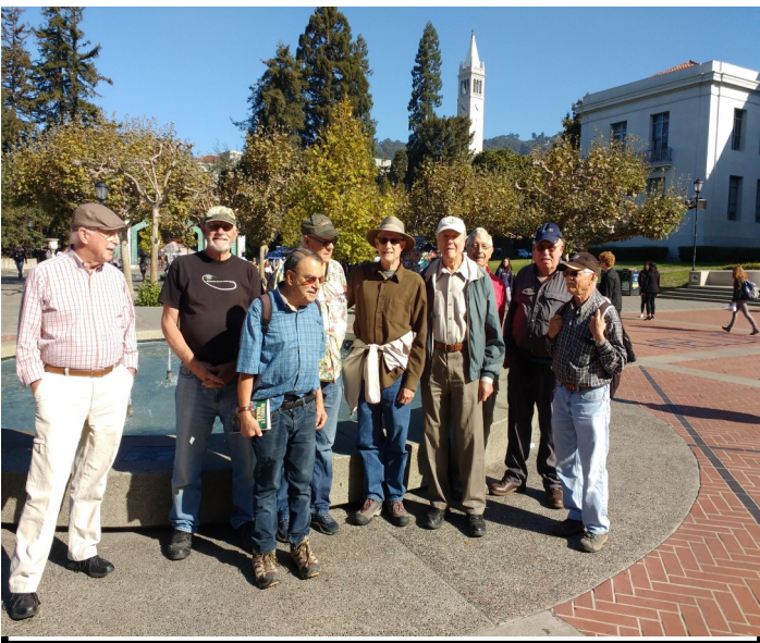
Sir Hiking Group at Bezerkly

The Monday preceding the Fourth Tuesday Branch 47 Luncheon Meeting