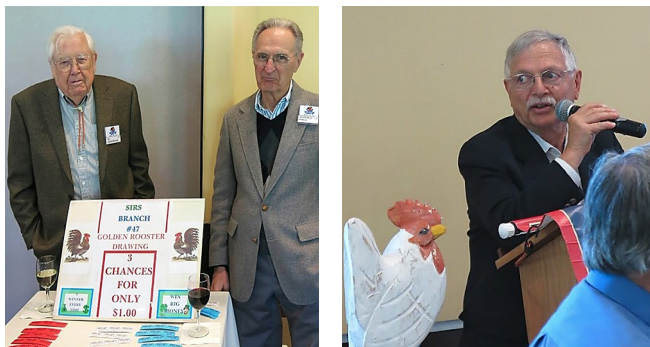
The unruly mob they lead