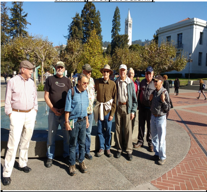
Sir Hiking Group at Bezerkly