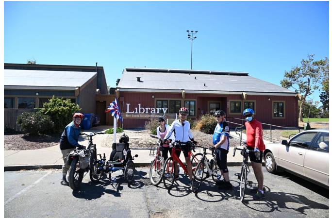
SIR Branch 35 group photo from September 2024.

Driving Directions: From Silicon Valley take I-880 heading North, exit on Hesperian Blvd (about 20 miles from Mt View/Palo Alto area) turning left on to Hesperian Blvd, then right on Grant Avenue and turn right into the trail parking lot (near the end of Grant Avenue). Plug Into your car GPS: 2561 Grant Avenue, San Lorenzo. This will direct you the building next to the Hayward Regional Parking Lot (park here).