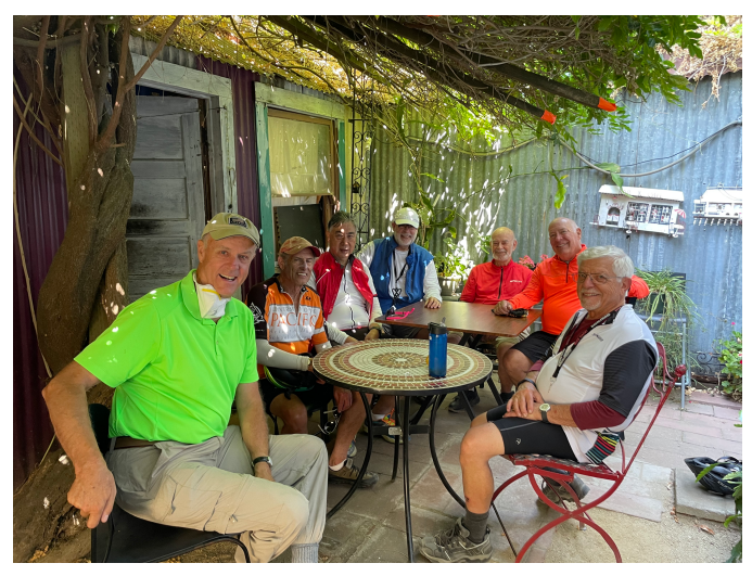
SIR Branch 35 riders group photo at lunch in downtown Niles