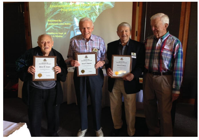
New Ninety Year Olds Certificates