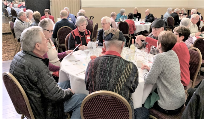
Enjoying the Ladies