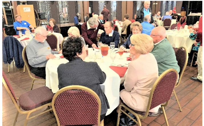
Enjoying conversation with the ladies