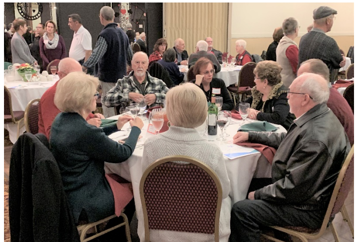
Enjoying the Ladies on their day.