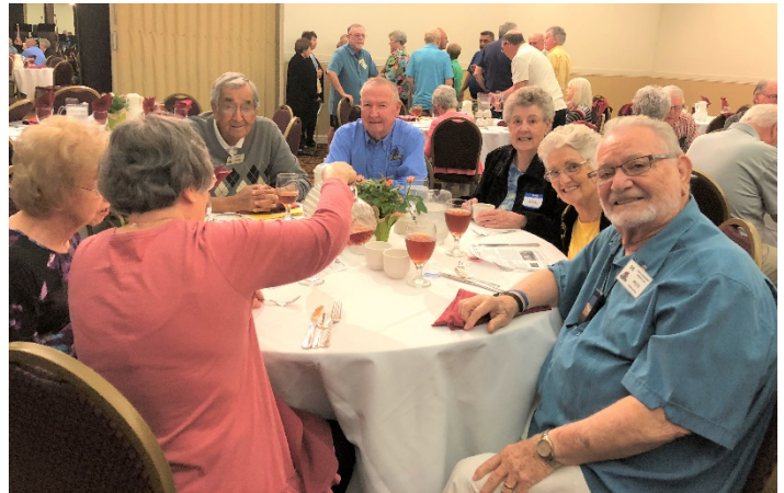
Enjoying one another's company and conversation.