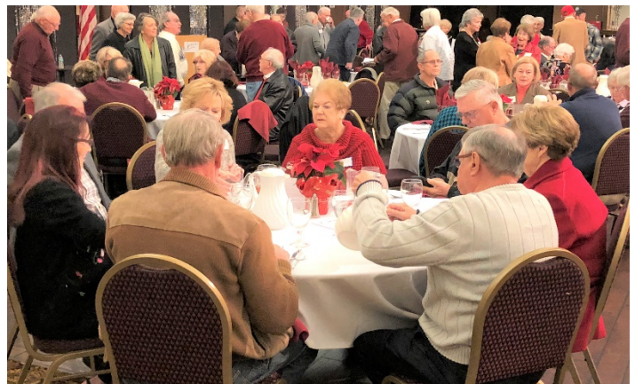
Enjoying conversation and company