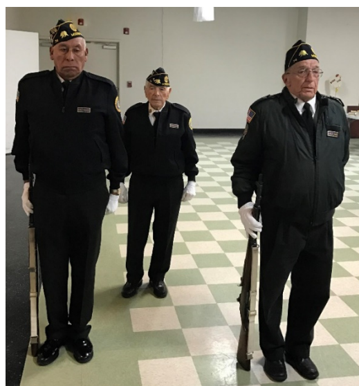
Color Guard for Veteran's Day