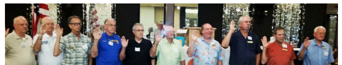
Officers and Directors for 2016