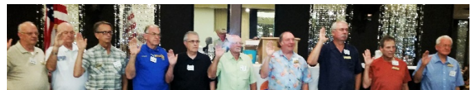
Officers and Directors for 2016