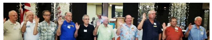
Officers and Directors for 2016