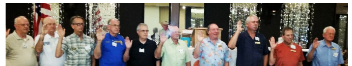
Officers and Directors for 2016