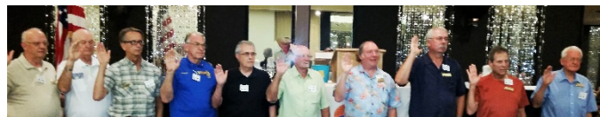
Officers and Directors for 2016