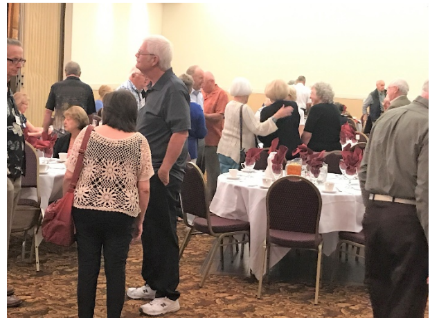
Members and the Ladies arriving