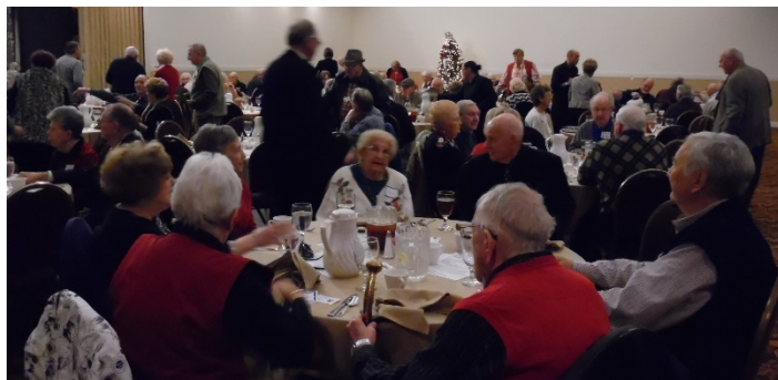
Another Picture on Page 8

"Please remember that with a new calendar year SIR Branch #144 needs your $24.00 annual donation to pay State assessments, newsletter costs, speaker lunches, etc.! Thank you!"