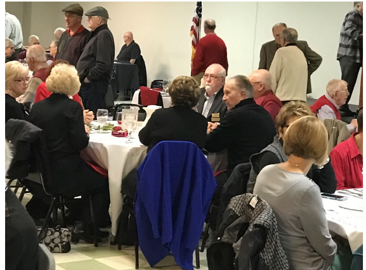
Enjoying Conversation (more pics on page 6)

We are now back at the Seasons. The price of Luncheons will be $16. We will still be meeting on the 3 rd Thursday of each month. Luncheon is January 19, 2017.