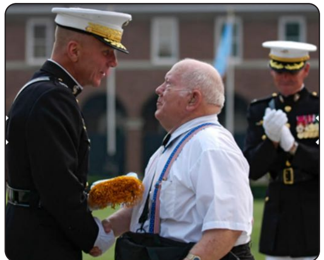
It was during that ceremony that this photo was taken.